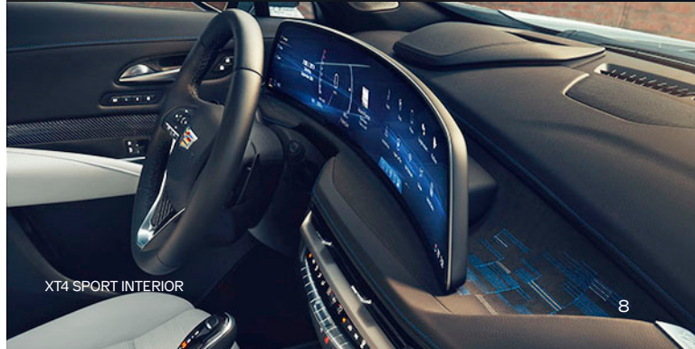
XT4 SPORT INTERIOR